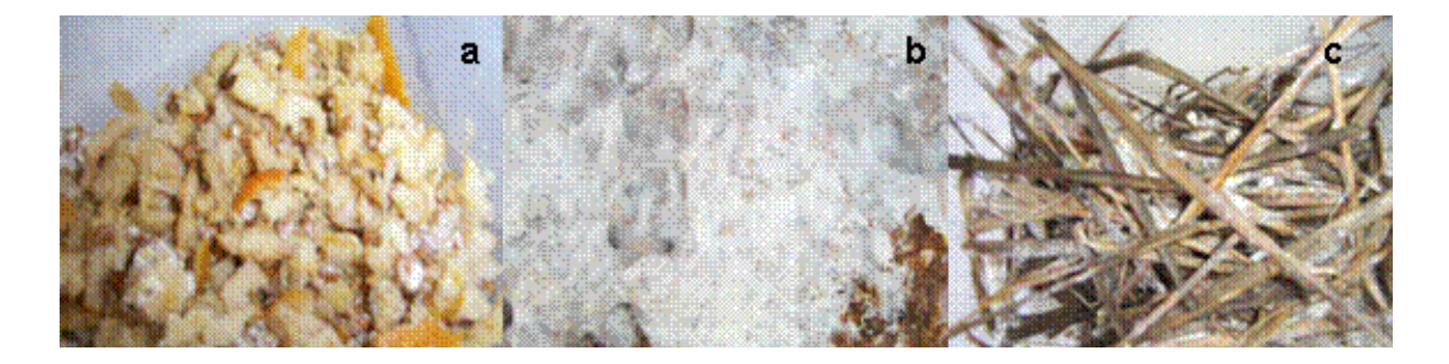
Figure 1. Mycelial colonization by P. ostreatus 814 on citrus bagasse and rice straw.

(b) 44 days of fermentation on citrus bagasse.