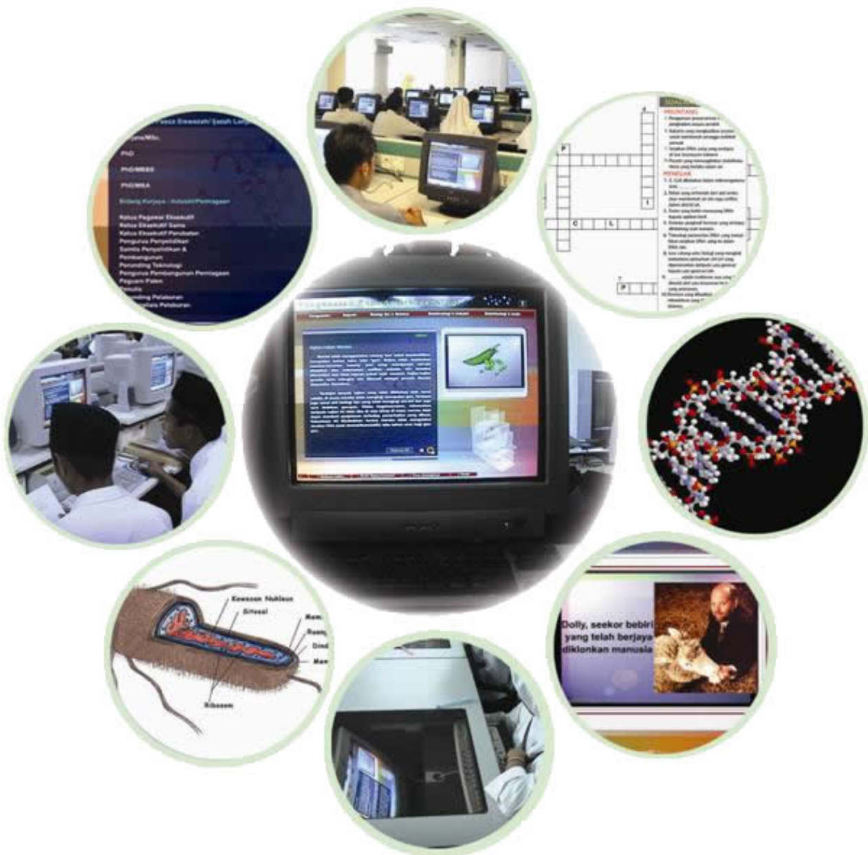
Figure 4. A montage of the multimedia kit distributed to the schools in the form of CDs which include information and trivia on biotechnology, animations explaining processes and procedures in a molecular biology laboratory, electronic crosswords and interactive molecular graphics visualization interface for virtually exploring a DNA molecule.

PCR (Polymerase Chain Reaction) (Figure 3). In these sessions the students are exposed to many basic procedures in a molecular biology laboratory. The resources required are minimal and can usually be obtained from a high school lab or the kitchen. Chemicals, reagents and equipment such as agarose, restriction enzymes and electrophoresis sets are provided by the facilitators. These are funded by the Ministry of Science, Technology and Innovation. The main purpose of these hands on activities was to simply demonstrate that all living organisms carried molecular genetic material (nucleic acids) which can be extracted and analyzed. These sessions also include discussions as to how the genetic material could be used for differentiation