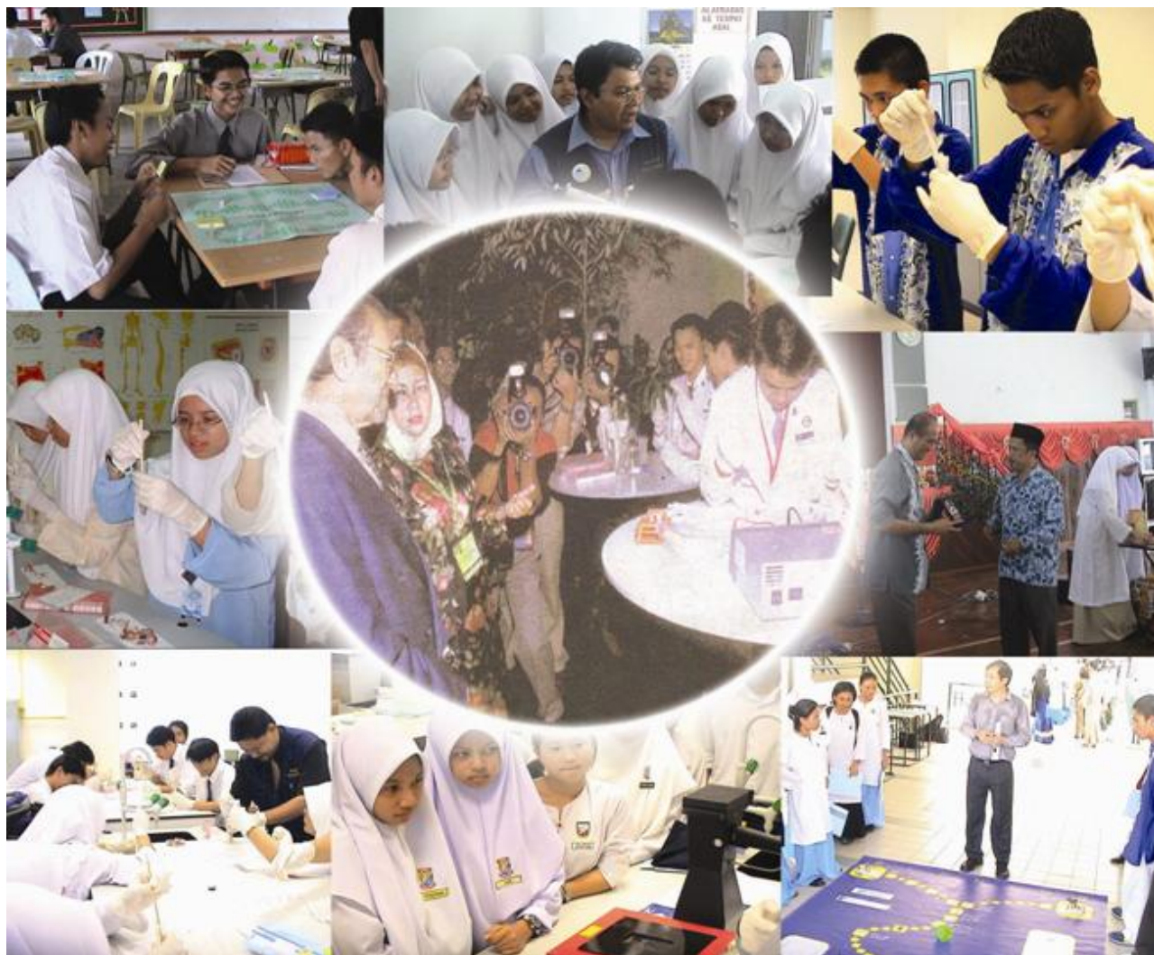
Figure 3. A montage of the activities carried out in the Malaysian High Schools Biotechnology Awareness program and serves to illustrate the interaction that was achieved by practicing scientists, senior academics and the target high school students during the course of the sessions. The central insert shows the Hon. Dr. Mahathir Mohammad, former Primer Minister of Malaysia, observing the students extracting chromosomal DNA from onions.

sessions were either good or excellent and the time that was allocated for each session was satisfactory (Figure 2b).