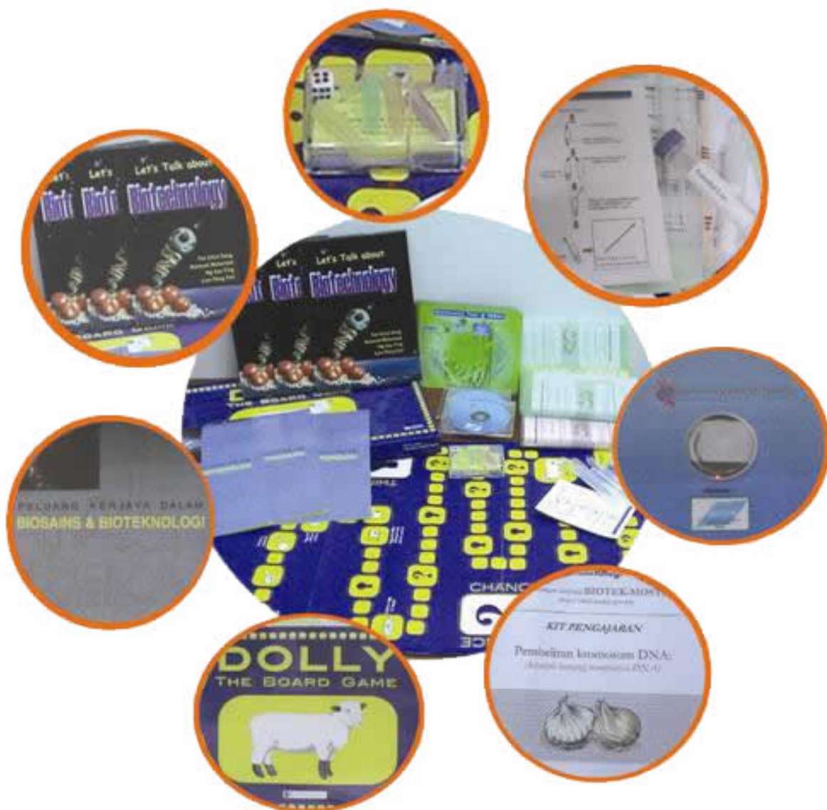
Figure 1. Montage of the kits and logistics which are distributed to the participating schools including career guidance pamphlets, games, DNA extraction kits (for onion chromosomal DNA), CDs and literature packages.

The policy makers are faced with the problem of responsibly educating the Malaysian public, while at the same time seeding the grassroots with the prospects of careers in biotechnology research and industry. It was deemed that one feasible and effective way of doing this was by embarking on a biotechnology awareness program targeted at students of Malaysian high schools. This decision was made considering that the final years of high school is usually a time when students start thinking about true career directions as opposed to just childhood dreams. This age range was also selected when taking into account the maturity of the students, to begin comprehending modern biotechnology, and at the same time, this age range was also deemed suitable as students of this age group are generally vocal and critical enough to disperse the